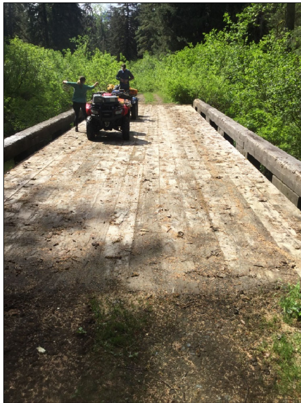
Figure 3.—Bridge surface at waypoint 444.