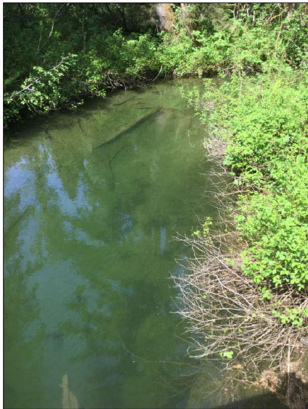
Figure 2.—Channel at waypoint 444.