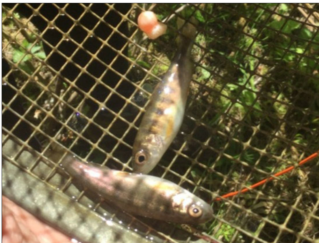
Figure 1.—Juvenile coho salmon captured at waypoint 444.